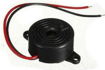
Fig 6: Buzzer

The buzzer is used as an audible alert mechanism during hazardous conditions. It immediately warns users when gas concentration exceeds safe limits.