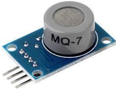
Fig 5: MQ-7 Sensor

The MQ-7 sensor is used to detect carbon monoxide gas present in indoor environments. It provides accurate monitoring of toxic gas levels to improve safety.