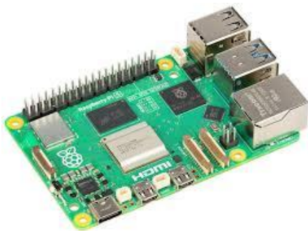
Fig 2: Raspberry

Raspberry Pi acts as the main processing and control unit of the Aero Care Predictor system. It receives sensor data, processes information, and controls alert generation and cloud communication.