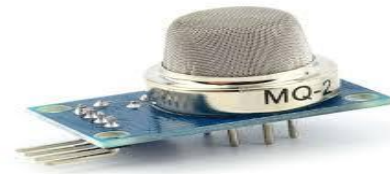
Fig 3: MQ-2 Sensor

The MQ-2 sensor is used to detect smoke and flammable gases in the environment. It continuously monitors air conditions and provides real-time sensing information.