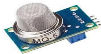
Fig 4: MQ-5 Sensor

The MQ-5 sensor detects LPG, natural gas, and combustible gas leakage. It helps in identifying hazardous gas concentrations and preventing dangerous situations.