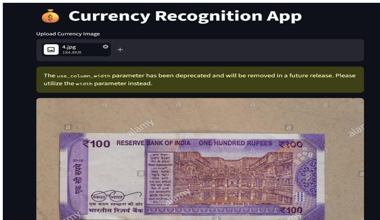
Fig. 1. Input page