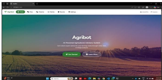
Fig 6: Performance Evaluation Graph

Teachers observed improved student participation and were able to monitor performance effectively using the dashboard. Parents were able to track their child’s progress and provide additional support. The feedback from both teachers and parents indicated that the platform was effective in enhancing.