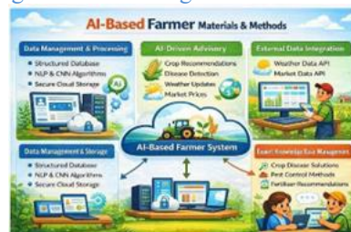
Fig 3: Development Environment

The data management and storage component is designed to efficiently organize and handle agricultural data within the system. It stores user information, query history, crop details, and disease-related data in a structured database. Each farmer is assigned a unique profile, and all interactions are recorded for future reference and