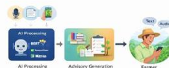
Fig 1: Content Flow