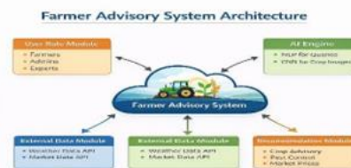
Fig 2: System Architecture

It allows to manage the administrators to manage the