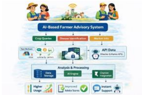
Fig 5: Experimental Setup

The implementation of AI-based advisory and realtime feedback contributed to improved farming decisions. the structured response system and timely recommendations helped farmers take appropriate actions, resulting in better crop management and productivity.