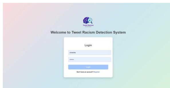
Fig. 3: Login Page