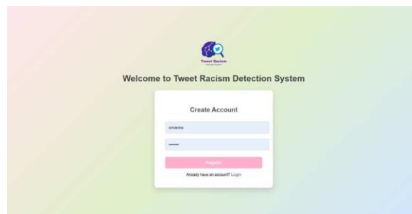
Fig. 2: Register Page

The system is deployed through a Flask web application. Users register, log in, submit tweet text, and instantly view classification results including predicted label, confidence score, sentiment type, and interpretation.