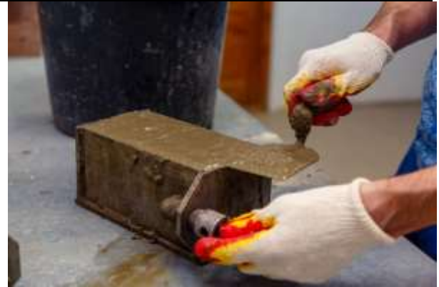
Fig 6.2: Mixing and Casting of Concrete