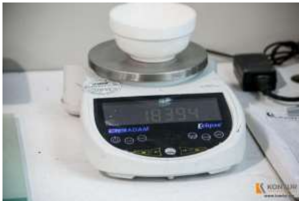
Fig 6.1: Material Selection and Mix Design