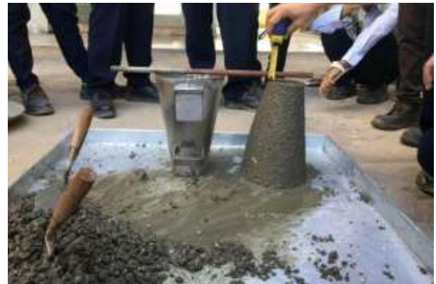
Fig 6.3: Fresh Concrete Testing (Slump Test)