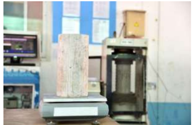
Fig 6.4: Hardened Concrete Strength Test