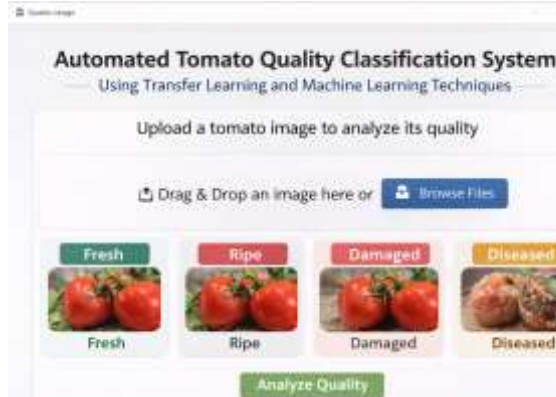
Fig 6.1: Uploading Image