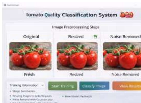
Fig 6.3: Image Preprocessing Steps