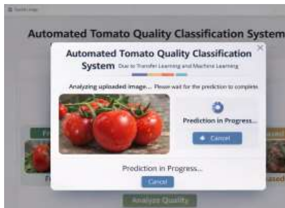
Fig 6.2: Prediction in Progress