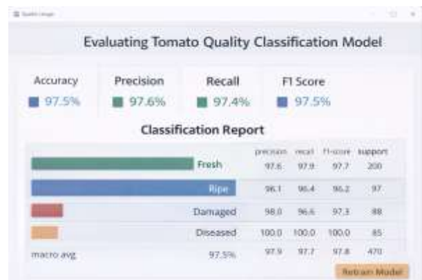
Fig 6.5: Classification Report