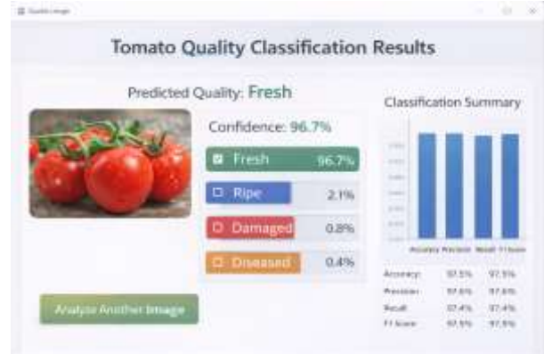
Fig 6.4: Tomato Quality Classification Results