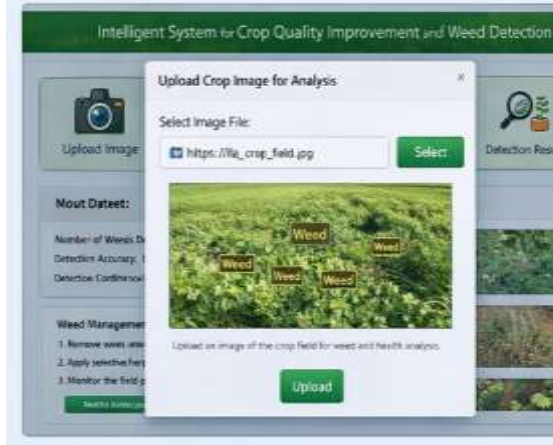
Fig 6.2: Dataset Upload