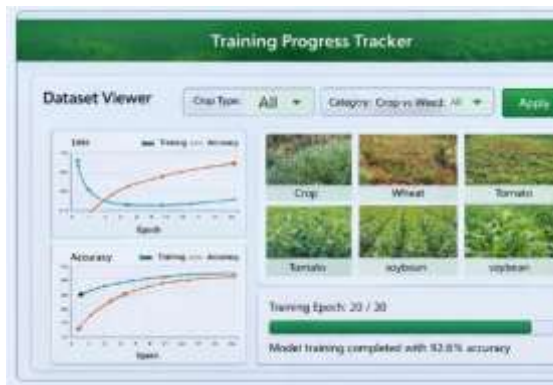
Fig 6.3: Training Models