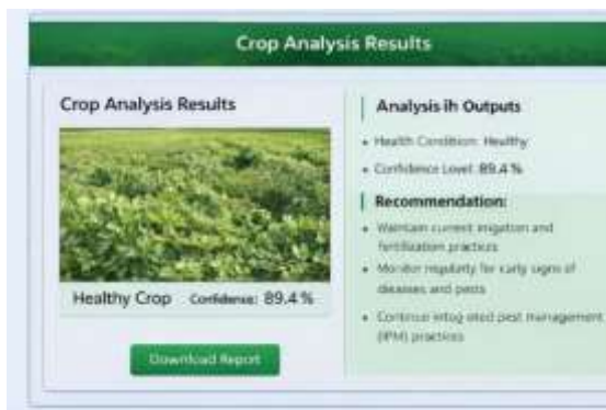
Fig 6.4: Crop Analysis Result