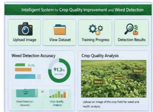
Fig 6.1: Home Page