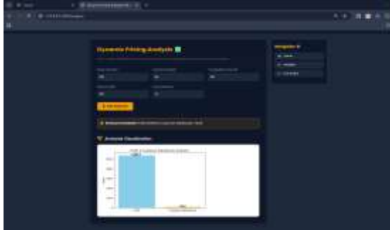
Fig 6.5: Dynamic Pricing Analysis