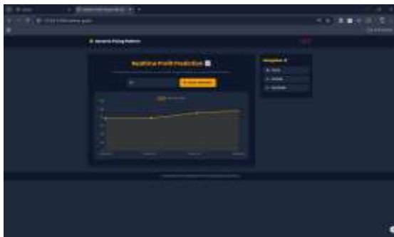
Fig 6.6: Real Time Prediction