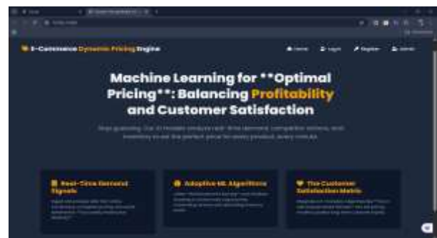
Fig 6.1: Home Page