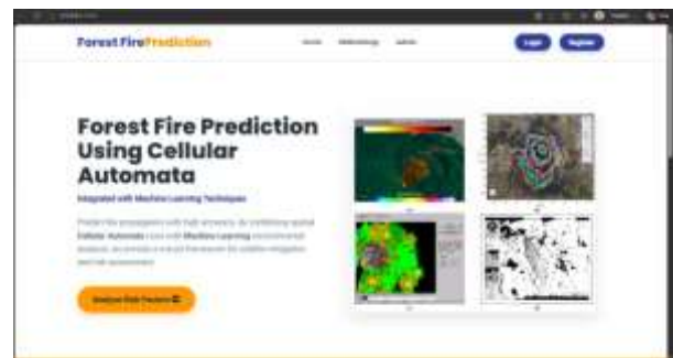
Fig 6.1: Home Page