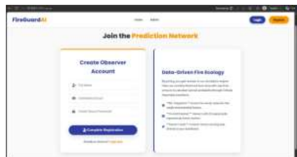
Fig 6.2: Registration