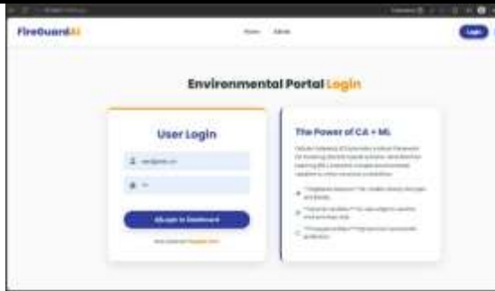
Fig 6.3: User Login