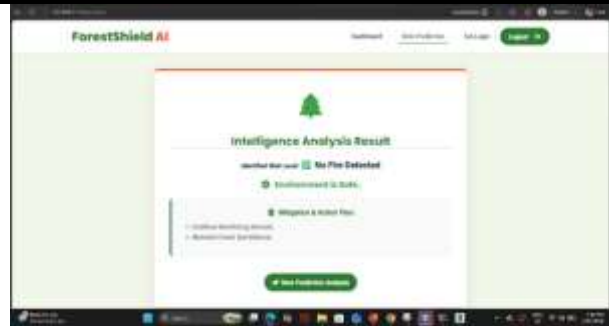
Fig 6.6: Output