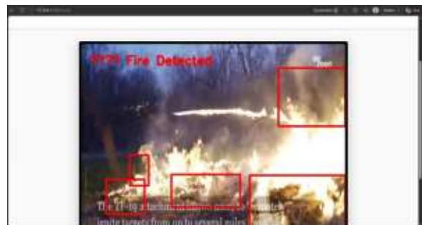
Fig 6.7: Fire Detected