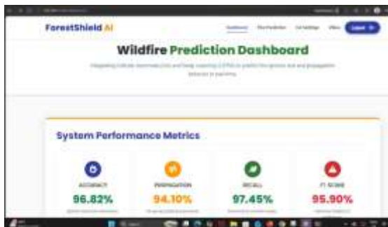
Fig 6.4: Fire Prediction Dashboard