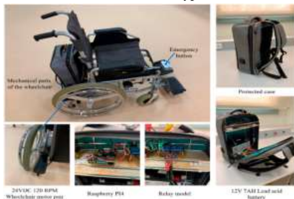
FIG. 6.2: Implementation

The Voice Recognition-Based Intelligent Wheelchair with GPS Tracking System is an assistive technology designed to enhance mobility and independence for elderly and physically challenged individuals. The system integrates voice recognition technology with microcontroller-based motor control to enable movement through simple spoken commands such as “forward,” “backward,” “left,” and “right.” The microcontroller (such as Arduino, Raspberry Pi, or NodeMCU) processes the recognized voice inputs and drives the wheelchair’s motors accordingly through a motor driver circuit. Additionally, a GPS module is embedded to continuously track the wheelchair’s real-time location, which can be transmitted via a GSM or IoT-based cloud platform to caregivers or family members for monitoring and safety purposes. In case of an emergency or abnormal situation, the system can