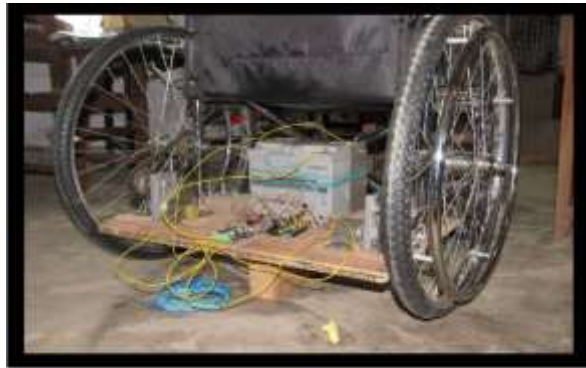
FIG. 6.1: Prototype