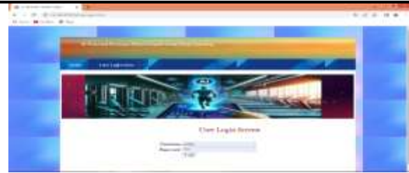
Fig.3 User Login

The Figure shows the Admin Dashboard of the AI Powered Personal Fitness Coach using Deep Learning project after a successful login. It provides options to train the deep learning model, view the training graph, perform activity recognition with fitness recommendations, and detect activities from uploaded videos . The dashboard acts as the central control panel where the administrator manages the system's core functionalities. It enables efficient monitoring of model performance and supports accurate exercise recognition. Overall, this interface helps ensure the smooth operation and management of the AI-based fitness coaching system.