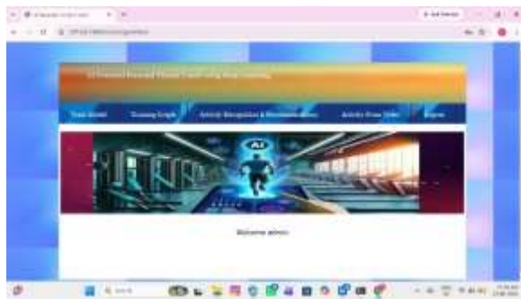
Fig.2 Admin Dashboard

personalized workout and health recommendations. The homepage serves as the entry point where users can access the application and begin their fitness journey. Overall, the design introduces the project's objective of providing intelligent, customized fitness guidance through deep learning technology.