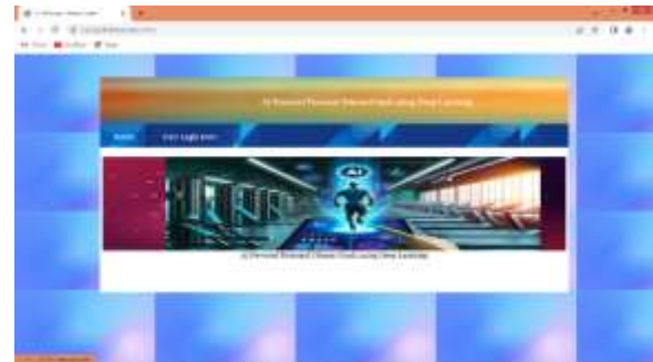
Fig.1 Home page

The Figure shows the home page of the AI Powered Personal Fitness Coach using Deep Learning project. It provides a user-friendly interface with navigation options such as Home and User Login for easy access to the system. The central fitness-themed banner represents the use of Artificial Intelligence to deliver