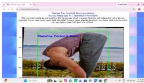
Fig.5 Activity Recognition & Recommendation

loss values indicate that the model is learning effectively and improving its predictions. The increasing precision and recall values demonstrate the model's ability to accurately recognize different fitness activities. Overall, the graph confirms that the trained deep learning model achieves reliable performance for exercise recognition and personalized fitness recommendations.