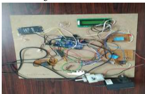
Fig 6: Proposed hardware model