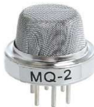
Fig2: GAS sensor

One of the most commonly used temperature sensors in an ORM device set is the micro controller. Since the detection is based on further transformation, it is in fact a metal-oxide (mos) based gas device, commonly known as a chemiresist. Yes, it rebels against both sorbents when water comes into contact with them. concentration levels after all propane may simply be found by using a voltage divider device.