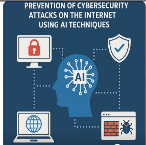
Figure 2: cyber security Jargon