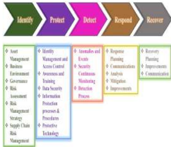
Figure 1: cyber security structure

systems. The following steps outline the methodology in detail. Problem Definition and Objective Setting: Define the types of cyber security attacks to be prevented (e.g., phishing, DDoS, malware, ransomware, SQL injection). Data Collection: Collect datasets from publicly available sources such as CICIDS, KDD Cup, NSL-KDD, or real-time network traffic logs. Include both normal and malicious traffic patterns to ensure balanced training data. Establish clear objectives such as anomaly detection, threat prediction, and real-time response. Data Preprocessing: Cleaning: Remove noise, duplicates, and irrelevant features from the dataset. Normalization: Standardize data to bring all features to a comparable scale. Labeling: Ensure that each instance is accurately labeled as normal or attack type. Feature Engineering: Extract relevant features using domain knowledge (e.g., IP address, protocol type, packet size, login frequency).