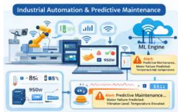
Fig 6.3: Industrial Automation & Predictive Maintenance