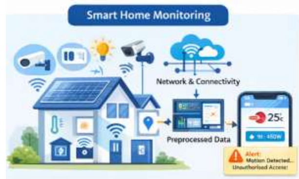
Fig 6.1: Smart Home Monitoring