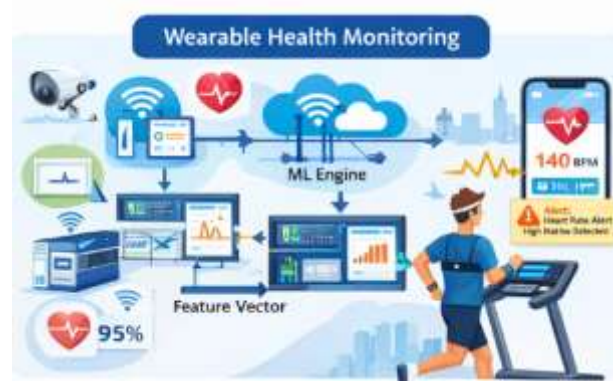
Fig 6.2: Wearable Health Monitoring