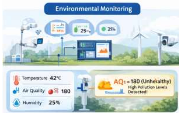
Fig 6.4: Environmental Monitoring